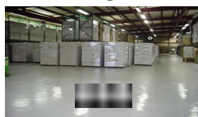
Warehouse / Distribution Center Tulsa, Oklahoma