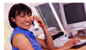
Sales Office 3104 South Elm Place, Ste I Broken Arrow, Oklahoma