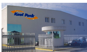
Production Plant Kool-Pack Plant, Mexico